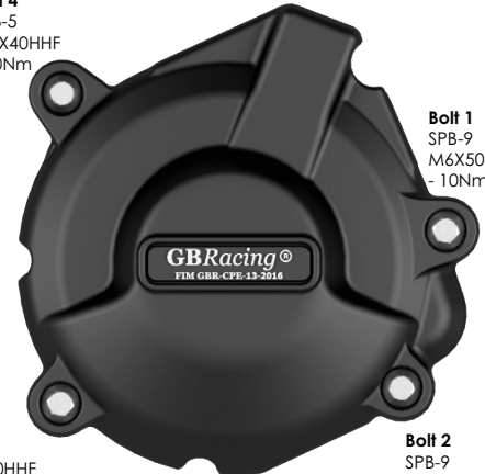
Bolt 3 SPB-9 M6X50HHF - 10Nm