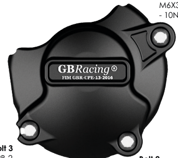
Bolt 2 SPB-9 M6X30HHF - 10Nm