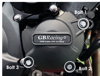
Bolt 3 SPB-2 M6X30HHF - 10Nm