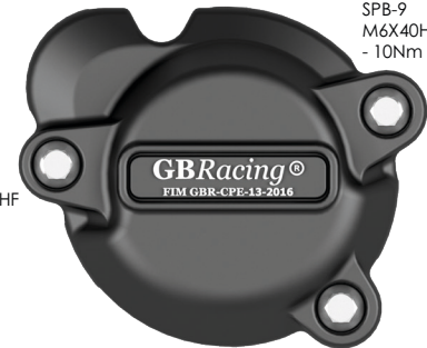
Bolt 3 SPB-9 M6X40HHF - 10Nm