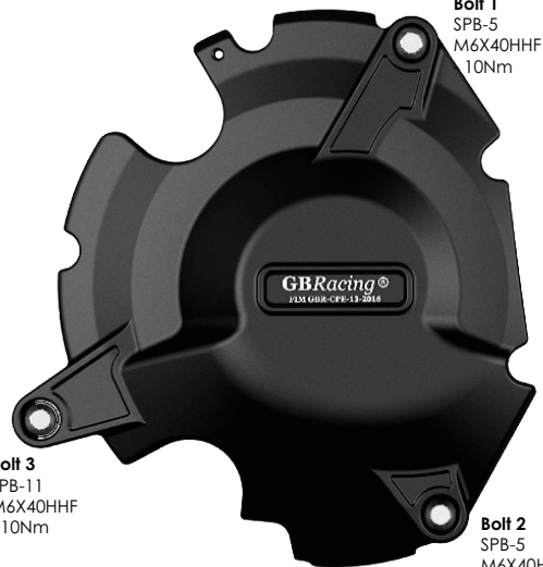
Bolt 2 SPB-5 M6X40HHF - 10Nm